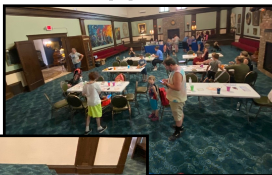
Above: Attendees choose their spots before School Supplies Bingo begins.

BINGO for School Supplies gave attendees a jumpstart on going back to school by providing a chance to win backpacks and other essentials. During the event, which was sponsored by Friends of the Library , over forty individuals tried their luck, with several heading home with a full array of useful materials for the upcoming school year.