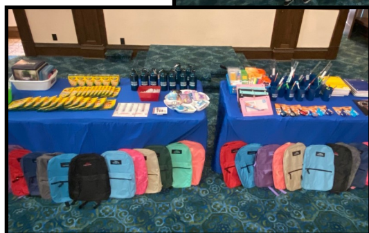
Left: Backpacks, water bottles, and other assorted prizes for winners.